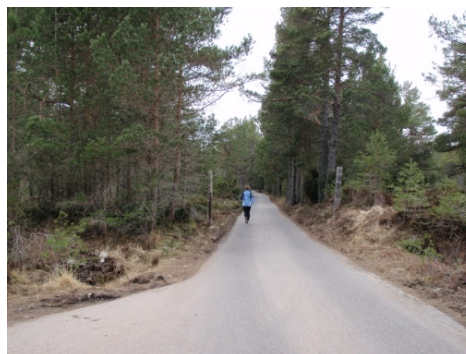
Fig.5 : Section of existing vehicular access route (view from junction with the northern section of the Old Logging Way, looking towards the junction with the public road)