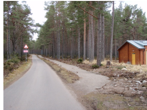
Fig. 4 : end of walkway at Centre