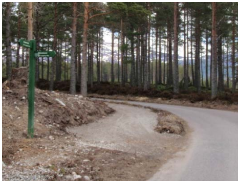
Fig. 3 : start of developed walkway